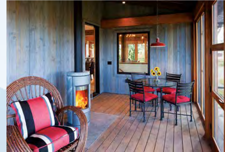
Located off of the great room, a covered porch helps keep the mosquitos at bay even while allowing fresh air to circulate. The fireplace is made from soapstone, and rotates on an axis to more evenly distribute its heat.

"It's like you are really living in the outdoors, but in a nice, warm, protected space," Siem said. "And then when you go outside, you are in it. The wilderness starts about a mile away from here, it's about as close as you can be in the most wild part of the state, with the [Yellowstone] river and proximity to the first national park."