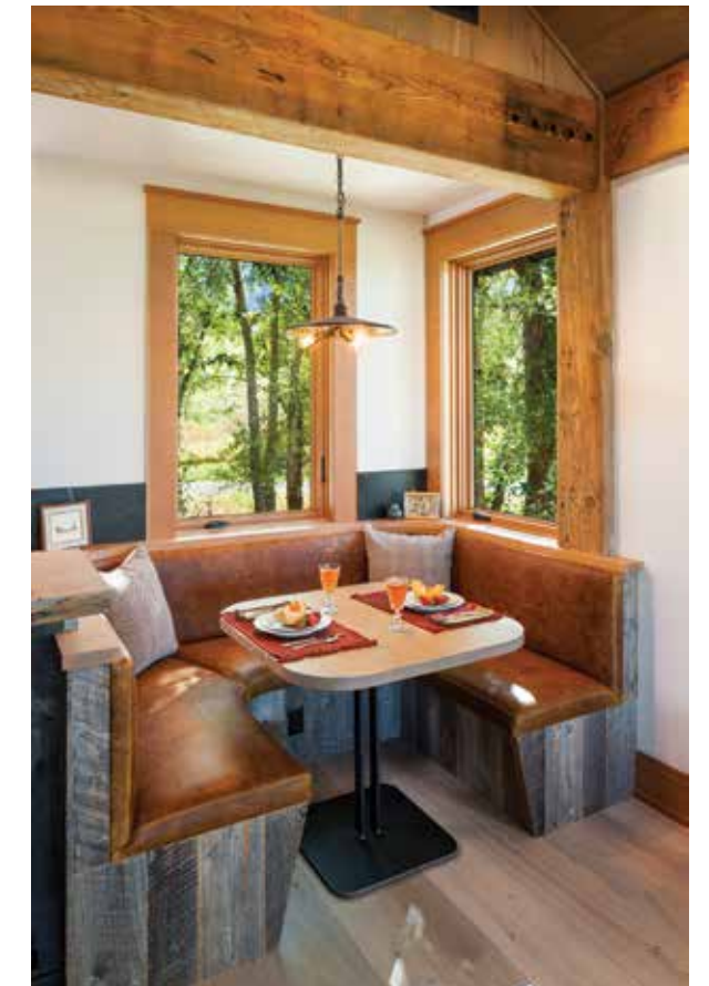
ABOVE: Contemporary touches were incorporated into the former Montana farmhouse. Steel elements were added throughout the home, from the timber trusses in the great room to the steel hand-rails on the stairs and exterior patios. RIGHT: The breakfast nook off the great room provides a cozy sitting area for informal meals or late-night games of Scrabble.

The home sits near a creek that waxes and wanes with the seasons, as it works its way down the valley to join the Yellowstone. Cottonwood trees line the riverbank and are visible from the home, which seems sheltered by the sharp figure of Black Mountain rising behind it. Neighbor’s cows graze nearby. Deer are so prevalent they “practically walk through the house,” and during construction a sow and her two cubs slept