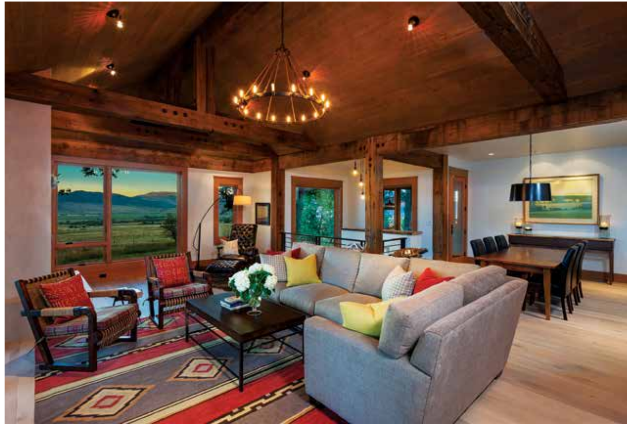
LEFT: A lofted ceiling lends an open feel to the great room even while complementing the exterior views. The interiors were designed to be comfortable and contemporary. “What [interior designer] Laura Fedro does so well are the textures, combining the different fabrics and finishes,” said homeowner Diana Rudolph. BELOW: The kitchen, where the homeowners spend most of their time, is open to the great room, allowing conversations to flow freely across the space.