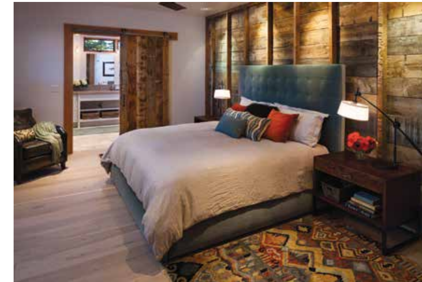
ABOVE: With an eye toward achieving a certain cohesiveness throughout the home, Brechbuhler Architects selected the stains, wall colors, tile, and countertops, as well as all the cabinet fixtures and bathroom accessories. LEFT: By way of paying homage to the former structure, the wood behind the bed in the master bedroom was sourced from the old farmhouse's siding.