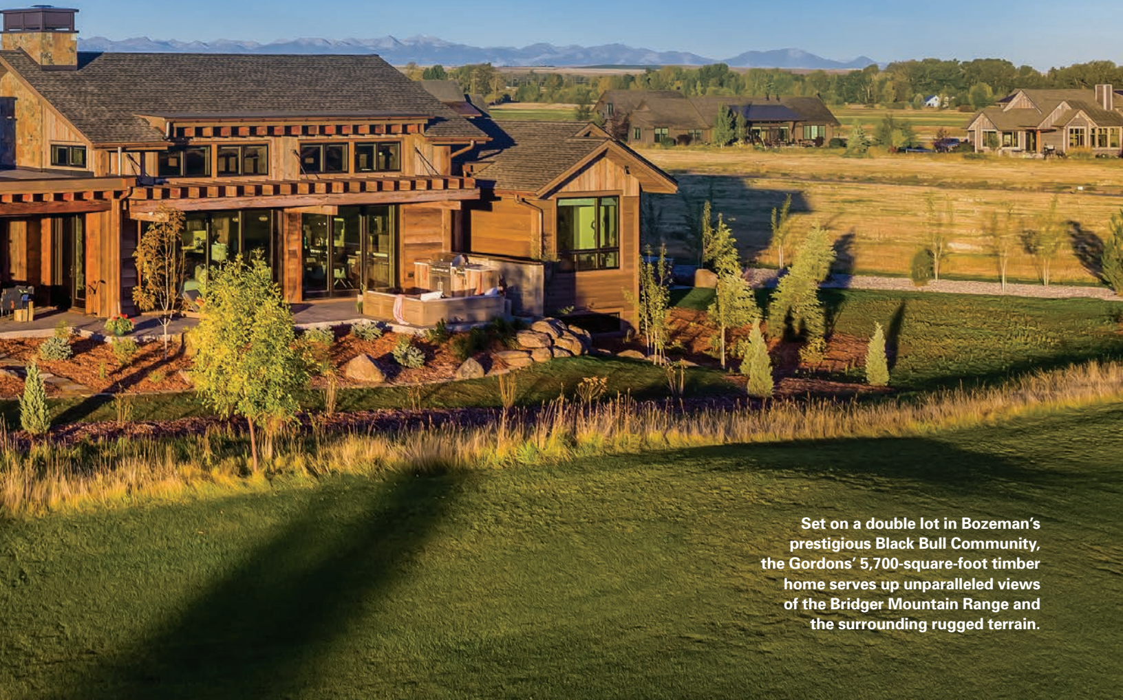
Set on a double lot in Bozeman’s prestigious Black Bull Community, the Gordons’ 5,700-square-foot timber home serves up unparalleled views of the Bridger Mountain Range and the surrounding rugged terrain.

“All of the fir timbers in the home are structural, and they are “as is,” meaning they have the natural patina they acquired over the many years that they were in service,” explains Andrew.