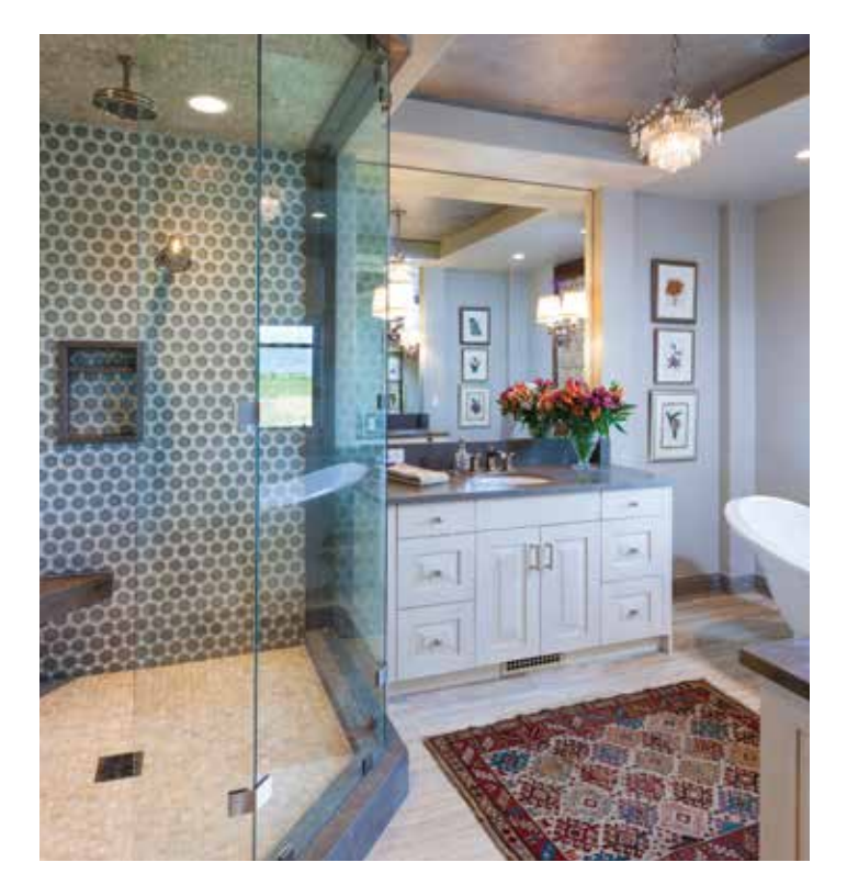
Eschewing rustic all together, in the master bath, the geometrical tile, glass and crisp finishes create a modern elegance.

What I think is important in my designs, is that the house sits calmly on the landscape; it's not something that jumps out too much..." says Brechbuhler